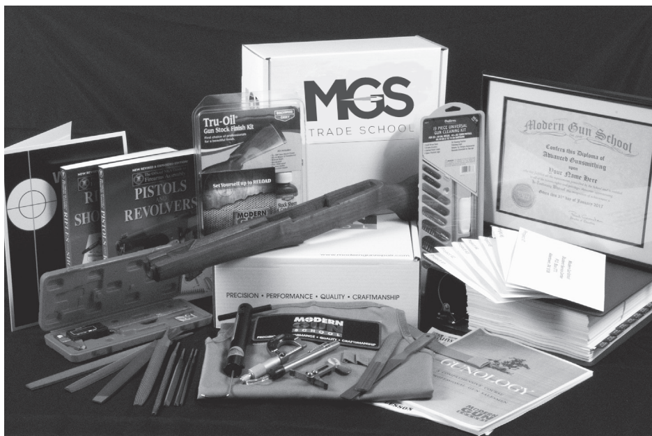
*Pictured above: Advanced Gunsmithing Course

Our student support continues to be “at your service” even after you complete your course.