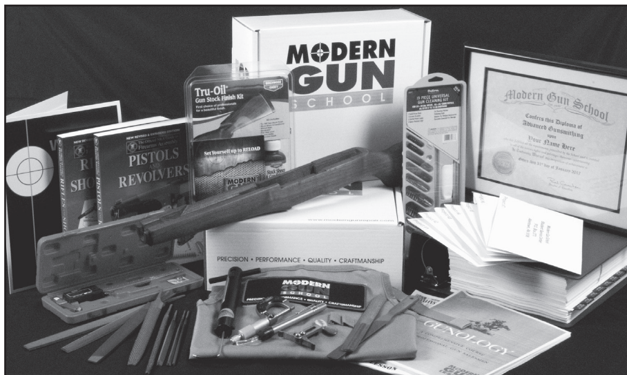
*Pictured above: Advanced Gunsmithing Course

Our student support continues to be “at your service” even after you complete your course.