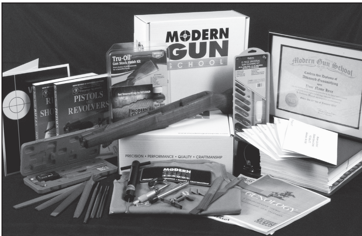
*Pictured above: Advanced Gunsmithing Course

Our student support continues to be “at your service” even after you complete your course.