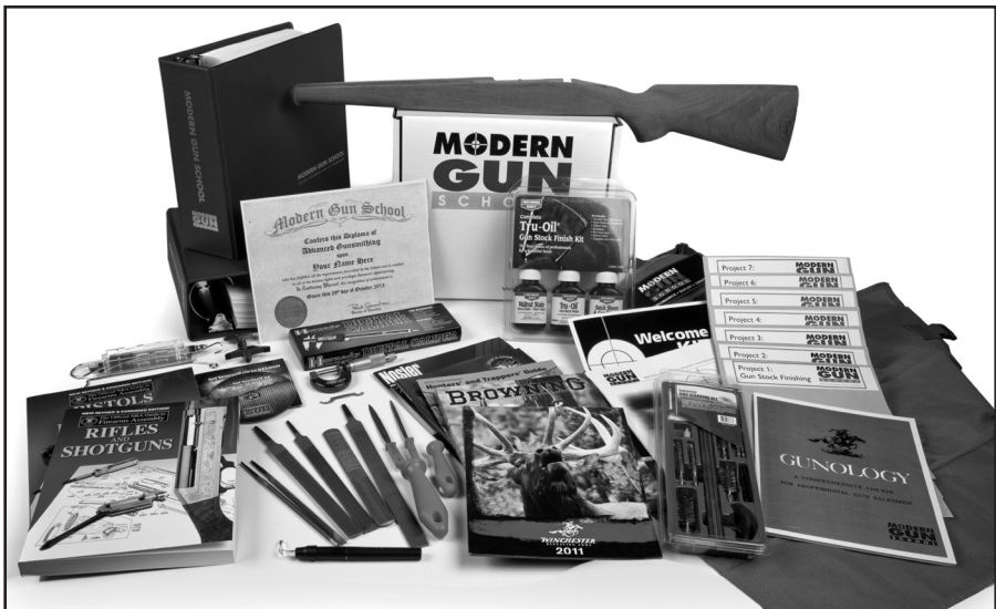
*Pictured above: Advanced Gunsmithing Course

Our student support continues to be "at your service" even after you complete your course.