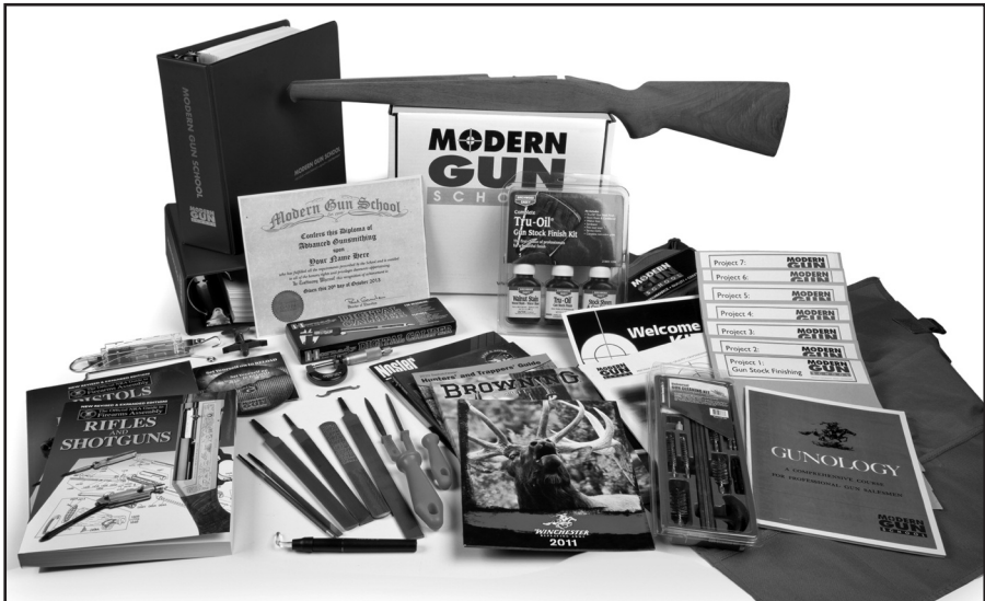
*Pictured above: Advanced Gunsmithing Course

Our student support continues to be "at your service" even after you complete your course.