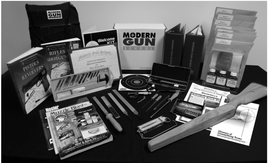
*Pictured above: Advanced Gunsmithing Course

Our student support continues to be "at your service" even after you complete your course.